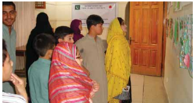
The students' paintings were displayed from October 20-23. Visitors are seeing with keen interest. Around 500 viewers visited during the four days of display.