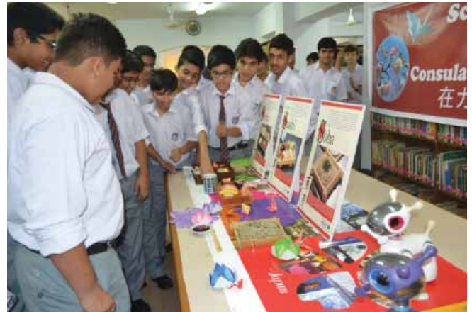
Students watching Japanese cultural items.

Two Pakistani university students, who visited Japan under the youth exchange program called “Kizuna Project (“bonds” in Japanese)” in September, 2011, also participated in the school visit program and made presentations of their stay in Japan and shared their experiences.