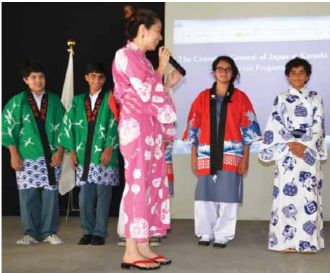
The students learning how to wear yukata (Japanese casual summer kimono) and happi (Japanese traditional short-sleeved coat).

A DVD called “Hello! Japan” covering Japanese culture, nature, technology and educational system, etc. was screened and the students experienced wearing yukata (Japanese casual summer kimono) and happi (Japanese traditional short-sleeved coat) as well as learning basic Japanese greetings and counting numbers.