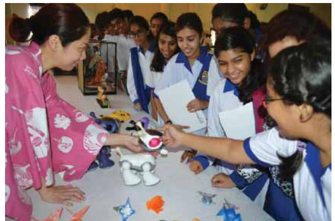
Students playing with Japanese pet robot, “Mio-Pup”.