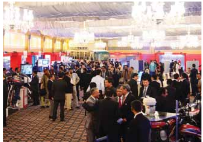
On the occasion of the Japanese Emperor's 81st Birthday Reception, "Japan Exhibition" was organized by the Consulate-General of Japan, in collaboration with Japan External Trade Organization (JETRO). 14 Japanese-related companies in Karachi have displayed their products such as motor cars, motor bikes, trucks, buses and tires, etc.