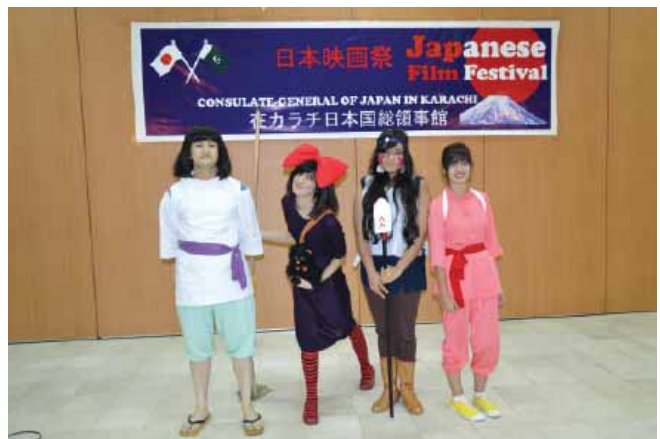
The four cosplayers dressed up as one of the characters from Studio Ghibli’s films

On this occasion, Cosplay (costume play) was organized by Metal Seinen, a Pakistani youth group who are actively engaged in promoting Japanese pop culture in Pakistan. To felicitate the first screening of Studio Ghibli’s film in Pakistan, four cosplayers dressed up respectively as one of the characters from its films, and gave a brief talk on how they are enchanted by Studio Ghibli’s films.