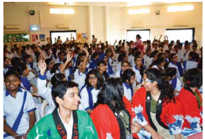
Students practicing basic Japanese greetings.

Four Pakistani students of the school, who visited Japan in February 2014 under the youth exchange program called “JENESYS (Japan-East Asia Network of Exchange of Students and Youths) 2.0”, made presentations of their stay in Japan.