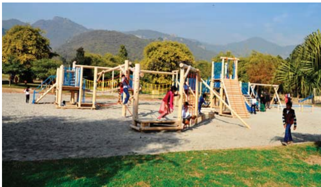
Children are playing in play land at Japanese Park

گزشتہ سال 31 دسمبر 2015 کو حکومتِ جاپان نے اسلام آباد میں قائم چلڈرن پلے لینڈ جو جاپانی پارک کے نام سے مشہور ہے میں بچوں کے کھیلنے کے لیے 70 ملین روپے کے جھولے اور دیگر سامان فراہم کیا ہے۔ حکومتِ جاپان نے 1985 میں جاپانی وزیراعظم جناب ناکا سونے کے پاکستان کے دورے کی یاد میں جاپانی بچوں کی طرف سے پاکستانی بچوں کے لیے دوستی کے تحفے کے طور پر جاپانی پارک اور بچوں کی کھیل کود کا سامان فراہم کیا تھا۔ تیس سال کا عرصہ گزرنے کے بعد کھیل کود کا یہ سامان کافی پرانا ہو چکا تھا اور اس کی بحالی کے لیے پُر زور درخواست کی جا رہی تھی۔ اسی پُر زور اسرار کے پیش نظر حکومتِ جاپان نے سی ڈی اے سے مشورے کے بعد بچوں کی کھیل کود کے اس پُرانے سامان کو تبدیل کرنے کا فیصلہ کیا۔ اُس وقت پاکستان میں جاپان کے سفیر جناب ہروشی انوماتا نے جاپانی پارک کے لیے بچوں کی کھیل کود کا یہ سامان ایک تقریب میں سی ڈی اے کی انتظامیہ کے حوالے کیا۔ یہ امداد حکومتِ جاپان کی طرف سے پاکستان کو دی جانے والی نان پراجیکٹ گرانٹ ایڈ کا حصہ ہے جس کا مقصد ترقی پزیر ممالک کی سماجی و معاشی ترقی کے حصول کے لیے کی جانے والی کوششوں میں معاونت فراہم کرنا ہے۔