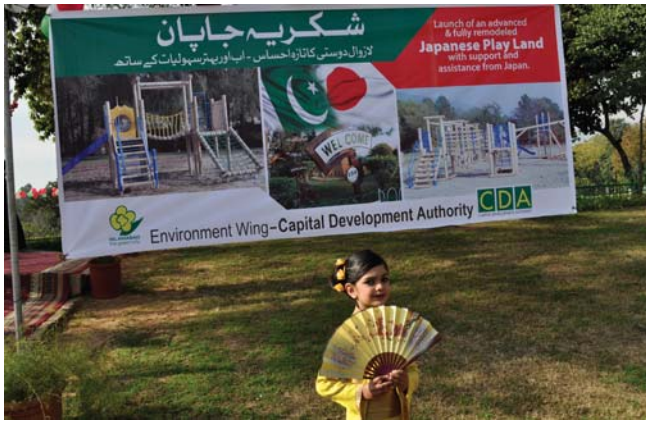
A girl welcoming visitors in Japanese Park