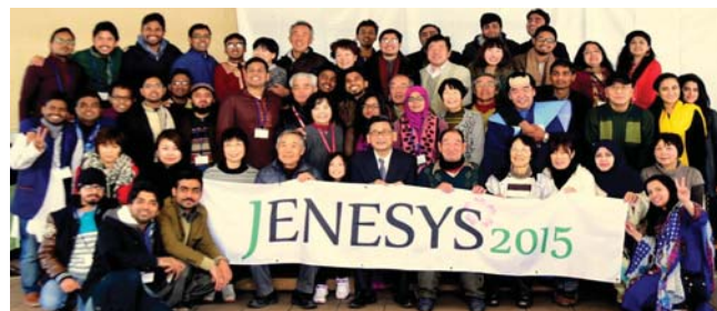
Group photo of the JENESYS participants

I just came back from Japan after a wonderful and very well organized and very well managed trip, it was a wonderful lifetime experience for me and I have learned and observed a lot about Japan, its culture, traditions and the Japanese people who are the most kindest people. I must say that Japan is a highly developed country with very well preserved social values and traditions. Each day of my stay was a new experience for me and I have found Japanese to be amazingly nice and loving people apart from their hard working nature. I must say that they have left no stone unturned to keep our stay very comfortable right from our take off to reaching back to our homes.