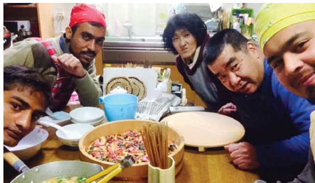
JENESYS participants at home stay in Japan

Japanese have preserved their temples and shrines in a very traditional way for their future generations. As we have visited the renowned Ritsumeikan University, we had a very close interaction with the students of that university. We exchanged the ideas about the current energy situations and learned about the new projects upon which the students are working nowadays. I have never seen a technology before which the Kyocera and Panasonic Centers are using. In term of technology, infrastructure, transport system like bullet trains, Japan is too much advanced than other countries of the region.