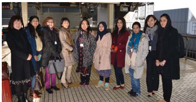
JENESYS participants at railway station in Japan