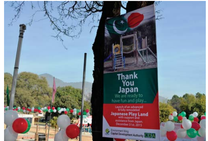
Inauguration of the Japanese Park

گزشتہ سال 31 دسمبر 2015 کو حکومتِ جاپان نے اسلام آباد میں قائم چلڈرن پلے لینڈ جو جاپانی پارک کے نام سے مشہور ہے میں بچوں کے کھیلنے کے لیے 70 ملین روپے کے جھولے اور دیگر سامان فراہم کیا ہے۔ حکومتِ جاپان نے 1985 میں جاپانی وزیراعظم جناب ناکا سونے کے پاکستان کے دورے کی یاد میں جاپانی بچوں کی طرف سے پاکستانی بچوں کے لیے دوستی کے تحفے کے طور پر جاپانی پارک اور بچوں کی کھیل کود کا سامان فراہم کیا تھا۔ تیس سال کا عرصہ گزرنے کے بعد کھیل کود کا یہ سامان کافی پرانا ہو چکا تھا اور اس کی بحالی کے لیے پُر زور درخواست کی جا رہی تھی۔ اسی پُر زور اسرار کے پیش نظر حکومتِ جاپان نے سی ڈی اے سے مشورے کے بعد بچوں کی کھیل کود کے اس پُرانے سامان کو تبدیل کرنے کا فیصلہ کیا۔ اُس وقت پاکستان میں جاپان کے سفیر جناب ہروشی انوماتا نے جاپانی پارک کے لیے بچوں کی کھیل کود کا یہ سامان ایک تقریب میں سی ڈی اے کی انتظامیہ کے حوالے کیا۔ یہ امداد حکومتِ جاپان کی طرف سے پاکستان کو دی جانے والی نان پراجیکٹ گرانٹ ایڈ کا حصہ ہے جس کا مقصد ترقی پزیر ممالک کی سماجی و معاشی ترقی کے حصول کے لیے کی جانے والی کوششوں میں معاونت فراہم کرنا ہے۔