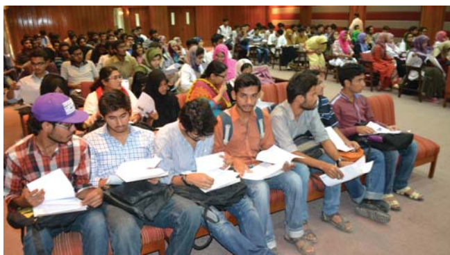
Students getting information at scholarship seminar in Karachi