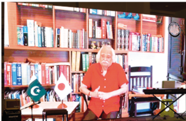
Video Message from Mr. Anwar Maqsood - a famous satarist, humorist and scriptwriter of Pakistan.