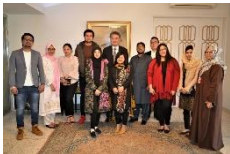
The Consulate held an orientation for a delegation of JENESYS 2019 Program on 17 January.