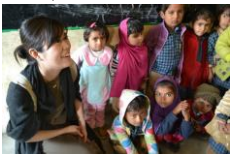
A visit to PRADO schools in Matiari District in Hyderabad to monitor the performance from 12-13 February.