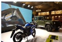
Wagon R and Jinxer displayed by Pak Suzuki Motors Co. Ltd.