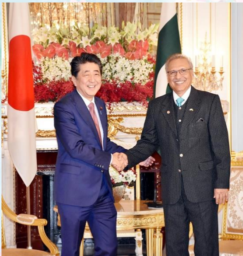
H.E. ABE Shinzo, Prime Minister of Japan and H.E. Dr. Arif Alvi, President of the Islamic Republic of Pakistan in Tokyo, Japan.

Embassy of Japan in Pakistan & Consulate-General of Japan in Karachi