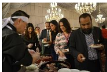
The guests enjoying sushi.