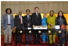
Consul-General ISOMURA Toshikazu hosted Emperor's Research Reception at PC Hotel on February 25, 2020.