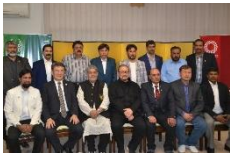
On 23 February, Consul-General Isomura hosted a reception marking the start of Tokyo Olympics and Paralympics 2020.