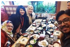
JENESYS 2019 participants enjoying udon and tempura at an authentic restaurant in XX during the trip.