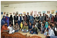
A one-day conference on "Post-War Economic Development of Japan" was held in collaboration with PJIF at University of Sindh on 23 January.