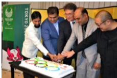
Olympic designed cake presented by Softball Federation Pakistan to celebrate the occasion.