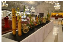
Ikebana work displayed at the reception.