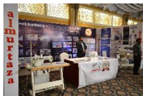
House hold and industrial sewing machines displayed by Almurtaza Machinery Co. (Pvt.) Ltd.