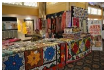
Embroidery items made by ARTS Foundation.