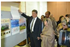
The Opening Ceremony of Calendar Exhibition 2020 was held at JICC on 21 January.