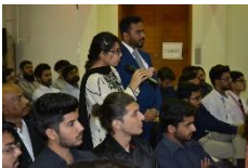
On 26 February, Kake Educational Institution Okayama organized a "Study in Japan" seminar at the Consulate.