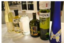
Japanese sake introduced at the reception.