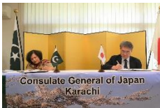
On 29 January, Japan extended a grant of US$ 98,969 to Kaus-e-Kazah Welfare Organization (KKO) under GGP scheme.