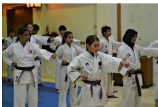
With Japan Karate Association (JKA), the Consulate hosted a two-day "Karate Workshop 2020" on 23-24 February.