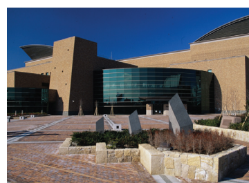
Fukuoka City Public Library (Library with a film collection)

The library houses about 512 Asian films as valuable cultural heritages. Inside the library is a movie hall.