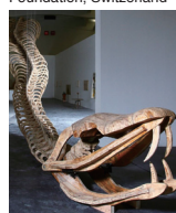
HUANG YONG PING Python's Tail Guy & Myriam Ullens Foundation, Switzerland

The museum is the only Asian modern and contemporary art museum in the world that systematically collects and exhibits Asian modern and contemporary art works.