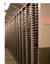
Film Archive About 983 films (including 512 Asian films) are stored.

The library houses about 512 Asian films as valuable cultural heritages. Inside the library is a movie hall.